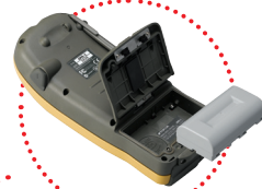
Removable Rechargeable Li-ion Battery